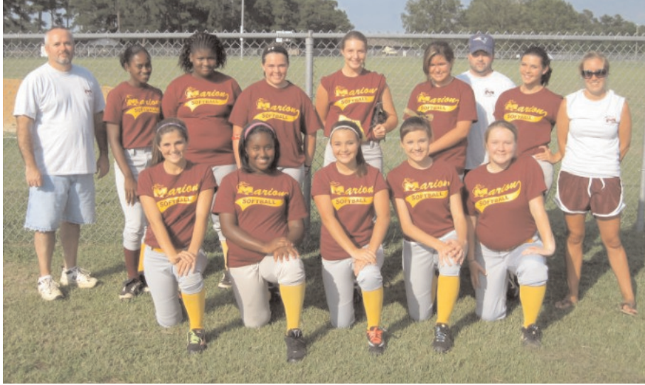
From left, then below and clockwise, are the 2012 Marion Recreation Department All-Star Teams: Belles; Angels; Dixie Youth Boys; Dixie Youth Minors; Dixie Youth Majors; and Ponytails, who made to the state playoffs.