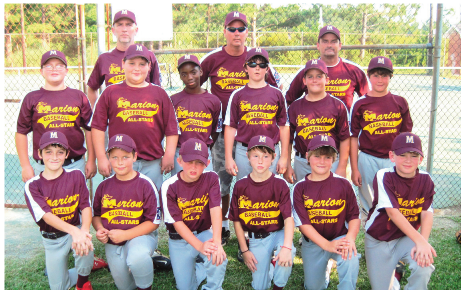
Thanks to all who helped to make this a successful season!