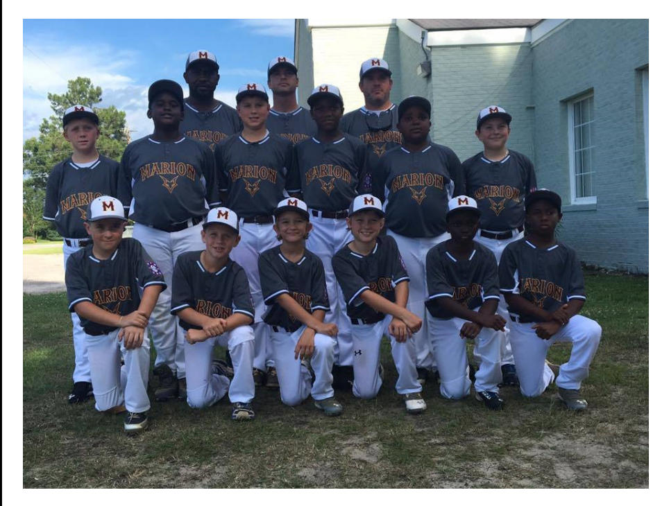
Congratulations to the 10U Boys All Stars, Great Job!!!

In an effort to improve on response time for emergency calls to 911, Police and Fire Department along with EMS is asking all residents of the City of Marion, SC to please post the correct house number outside of your residence. This is very important for you and your family members as well as the officers responding to the calls.