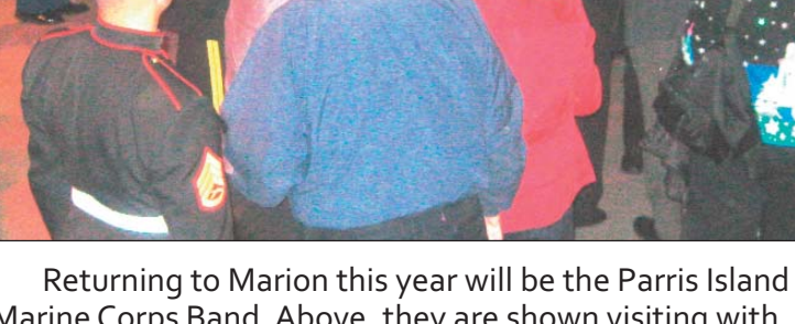
Marine Corps Band. Above, they are shown visiting with members of the audience after their 2009 concert.