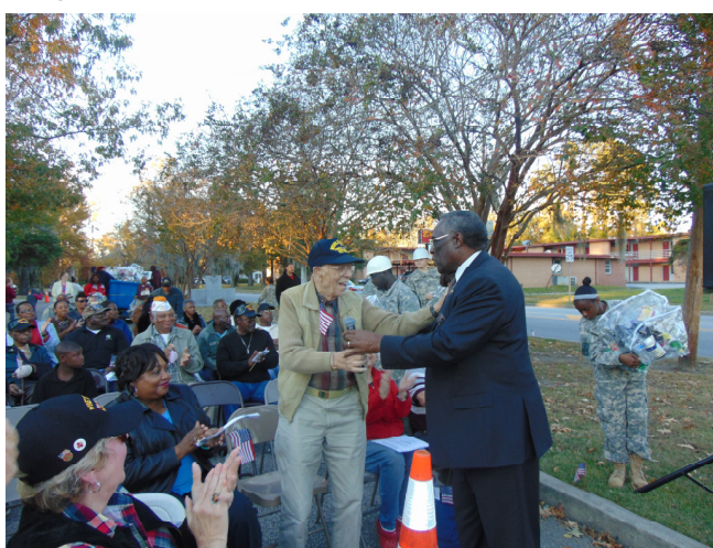
Regional Director from Senator Tim Scott's office.