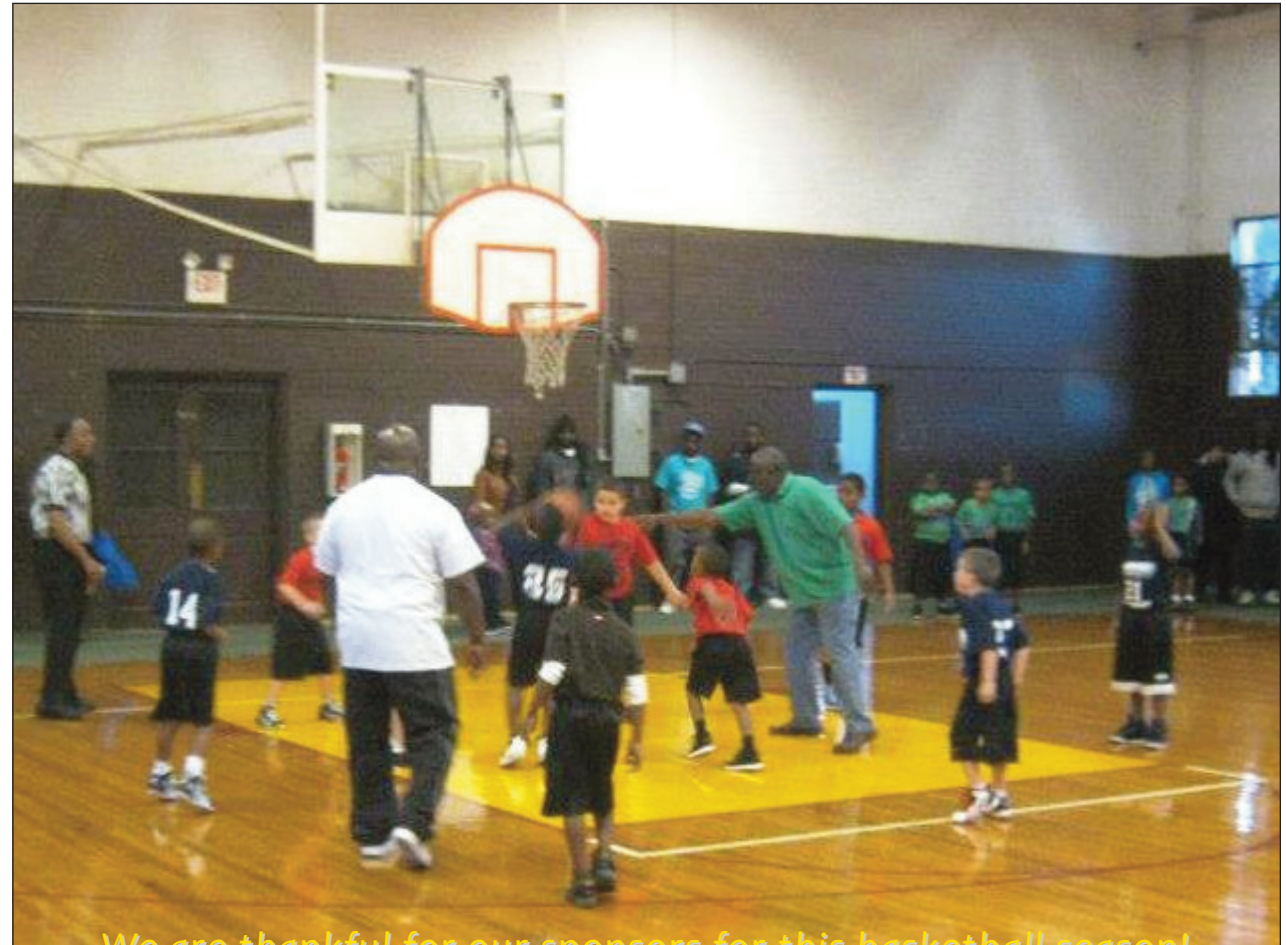
We are thankful for our sponsors for this basketball season!

5-6 (BOYS & GIRLS) PEE WEE MINORS 7-8 (BOYS & GIRLS) PEE WEE MAJORS 9-10 (BOYS) DIXIE YOUTH