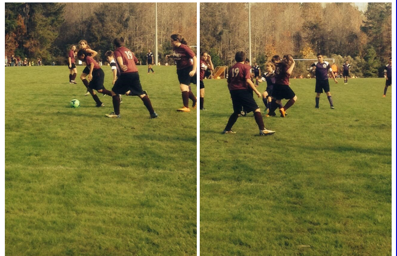
Congratulations on a job well done!!