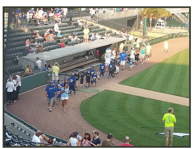
LET THE GAME BEGIN. PLAY BALL.

For more Information Call: (843) 423-5410 You can pay for tickets at the office & we will pick them up for you!