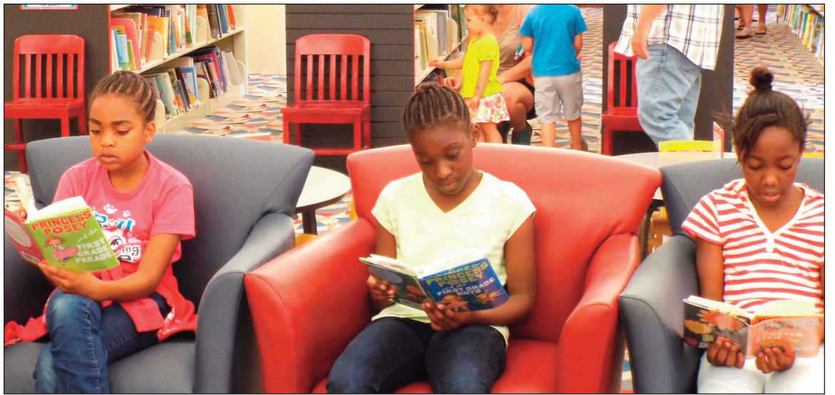
Above and below left, reading fun at the Bruce & Lee Foundation Library in Florence. Below right, back to school treats.